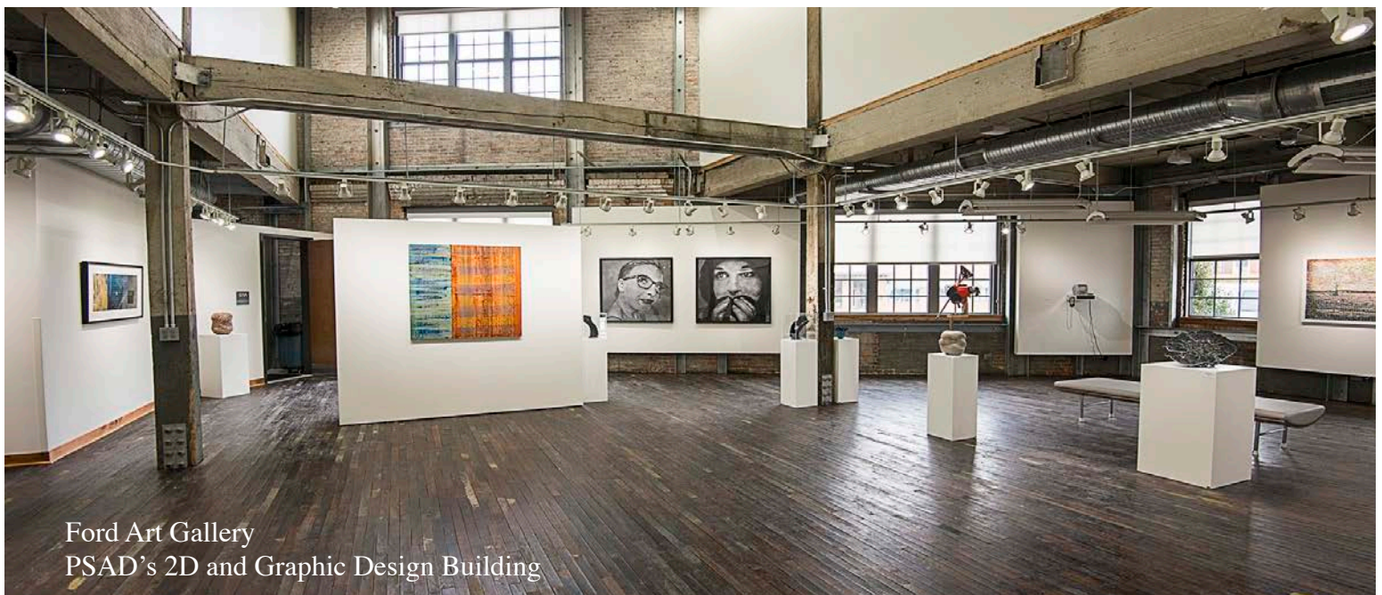
Ford Art Gallery PSAD's 2D and Graphic Design Building